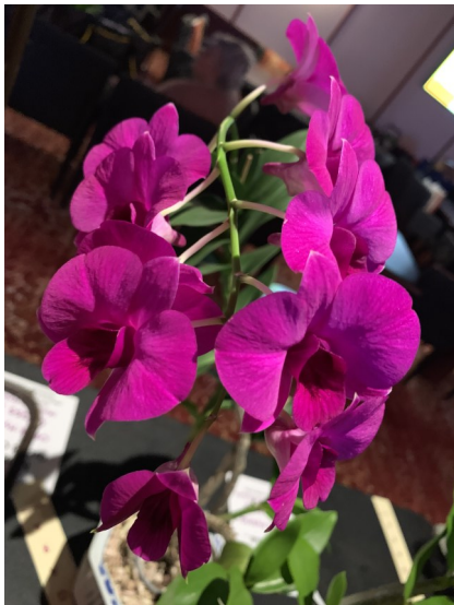
Dendrobium bigibbum 'Big Red' Grower: Thuy Tran