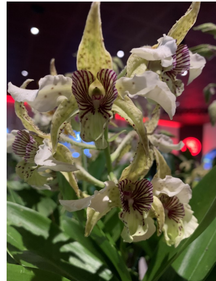
Dendrobium Sweet Heart Grower: Arnold Lockrey