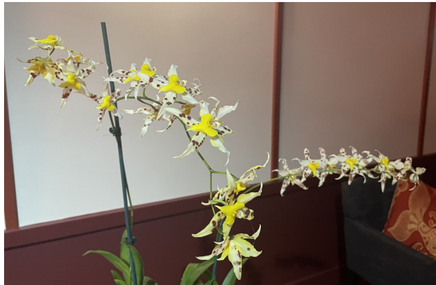
Odontioda Taylor Barfield 'This and That'