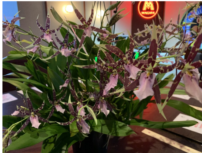
Oncidium Alliance Class Unknown